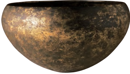
National Treasure Gilt bronze bowl with lions and Karakusa (Chinese floral) design Nara period, 8th century Owned by Gokokushiji Temple Exhibition period Full