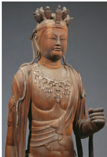
Important Cultural Property Standing Juichimen Kannon Bosatsu (Ekādaśamukha Avalokiteśvara) Nara period, 8th century Owned by Toshodaiji Temple Exhibition period Full

This exhibition is not only to introduce the achievements of Ganjin and Yoei, but also the background of Ganjin's visit to Japan and the Tang culture that Yoei experienced which made a great influence on mainly in Mino region both cultural and Buddhism through Japanese mission to Tang China.