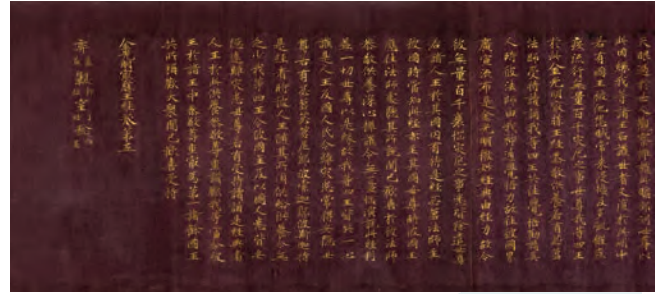
National Treasure Golden Light of the Most Victorious Kings Sutra, Volume 5 Nara period, 8th century Owned by Nara National Museum