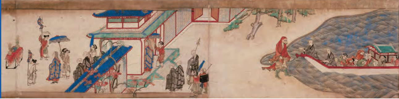
Important Cultural Property Toseiden emaki (Illustrated Scrolls of Ganjin-Wajo's expedition to Japan), Volume 3 Exhibition period Last half Kamakura Period (1298), Owned by Toshodaiji Temple ※There will be a panorama change during the exhibition period ※The panorama will be exhibited from 11/5 to 11/14